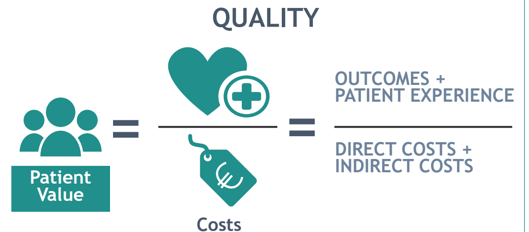
Figure 1. Porter's formula of outcome-driven healthcare.

Outcome-driven healthcare, also known as value-based healthcare, is a concept defined by Porter (2013) that aims to enhance value for patients by improving the quality of care and patient experience, while simultaneously reducing costs. Porter defines it as "the health outcomes achieved that matter to patients, relative to the cost of achieving these outcomes".